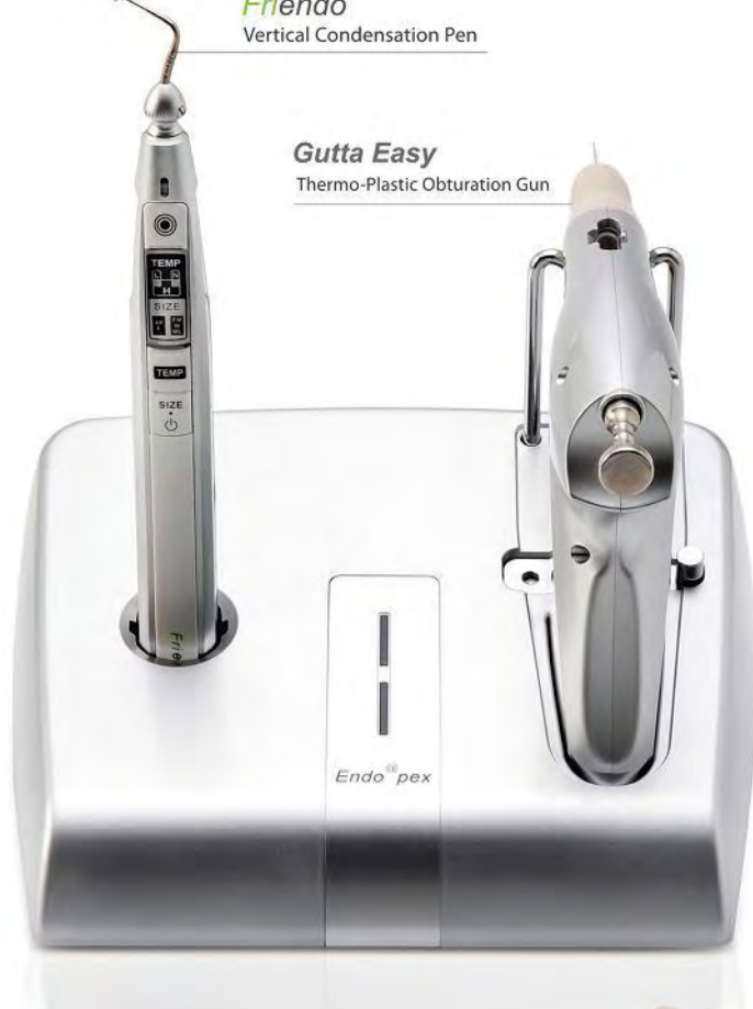
Friendo Vertical Condensation Pen

which offers optimum functionality and reliable apical control along with excellent tactile sensing. The Endo-Apex successfully delivers predictable results in vertical condensation and 3 dimensional thermo-plasticized obturation. The 2 most effective individual obturation devices (Friendo, Gutta Easy) are beautifully combined as one convenient package for maximum efficiency: "The Perfect Match".